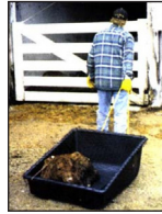
Kozy Kalf Sled