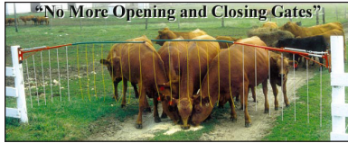
Drive-Thru Electric Gate